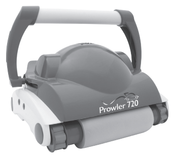
Kreepy Krauly Prowler 720 Protected by U.S. Patent Nos. 6,099,658 and 6,815,918