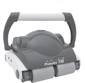
Kreepy Krauly Prowler 730 Protected by U.S. Patent Nos. 6,099,658 and 6,815,918

The Prowler<sup>®</sup> 730 Remote Control provides the ultimate in automatic pool cleaning convenience. It's the computer-controlled, programmed cleaner that scrubs and vacuums pool's bottom, walls and steps and provides supplemental filtration of pool water. The wireless radio remote control system provides two automatic cleaning options – one for the pool bottom and a second for the bottom and sides. Remote control functions allow for overriding the automatic cleaning modes to perform quick spot clean-ups. Simply guide the cleaner to any area of the pool with the touch of a button. It requires no installation, no booster pump, and no hoses.