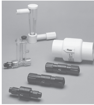
In-line Check Valves & Flow Indicators