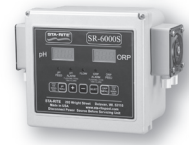
SR-4000, SR-6000 and SR-6000S Chemical Feeder Pumps