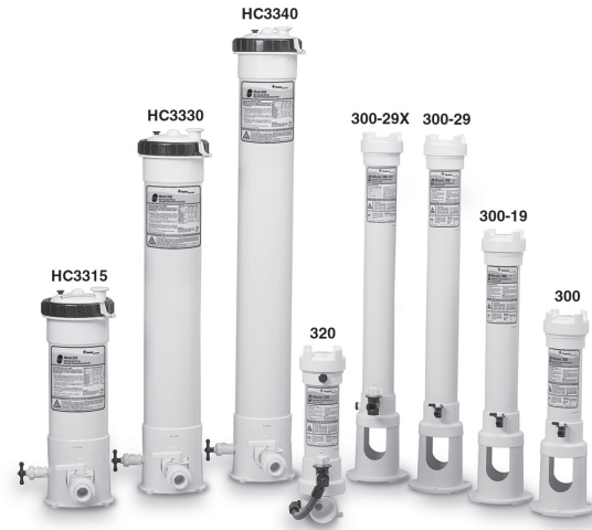
Rainbow Chlorine and Bromine Feeders

Years of customer use and satisfaction have proven Rainbow feeders to be the performance leader in pool & spa chemical dispensers.